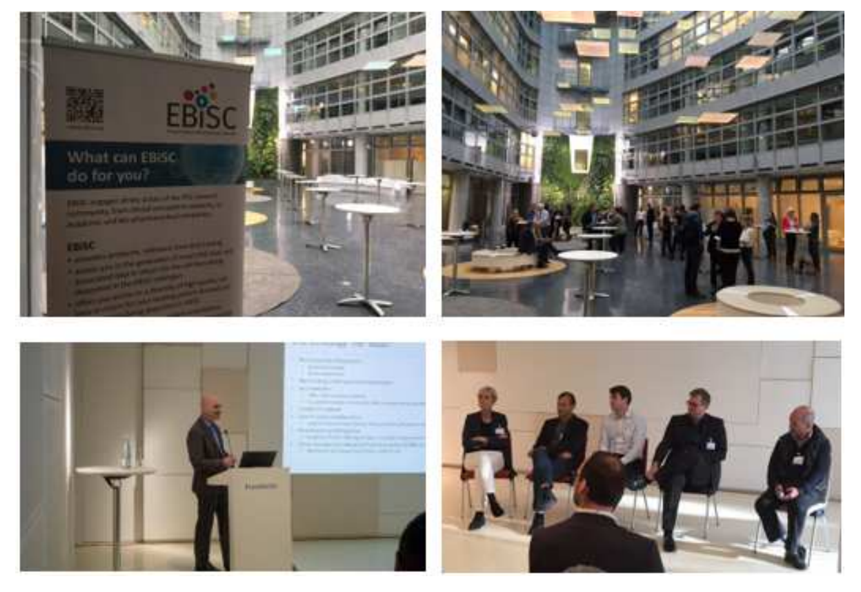
Figure 2: EBiSC Final Workshop on 2-3 November 2017 in Berlin

(Hot Start to European Pluripotent Stem Cell Banking & Rapid establishment of the European Bank for induced Pluripotent Stem Cells (EBiSC) - the Hot Start experience). At the end of period 4, a number of EBiSC related publications are under preparation at several partner organisations.