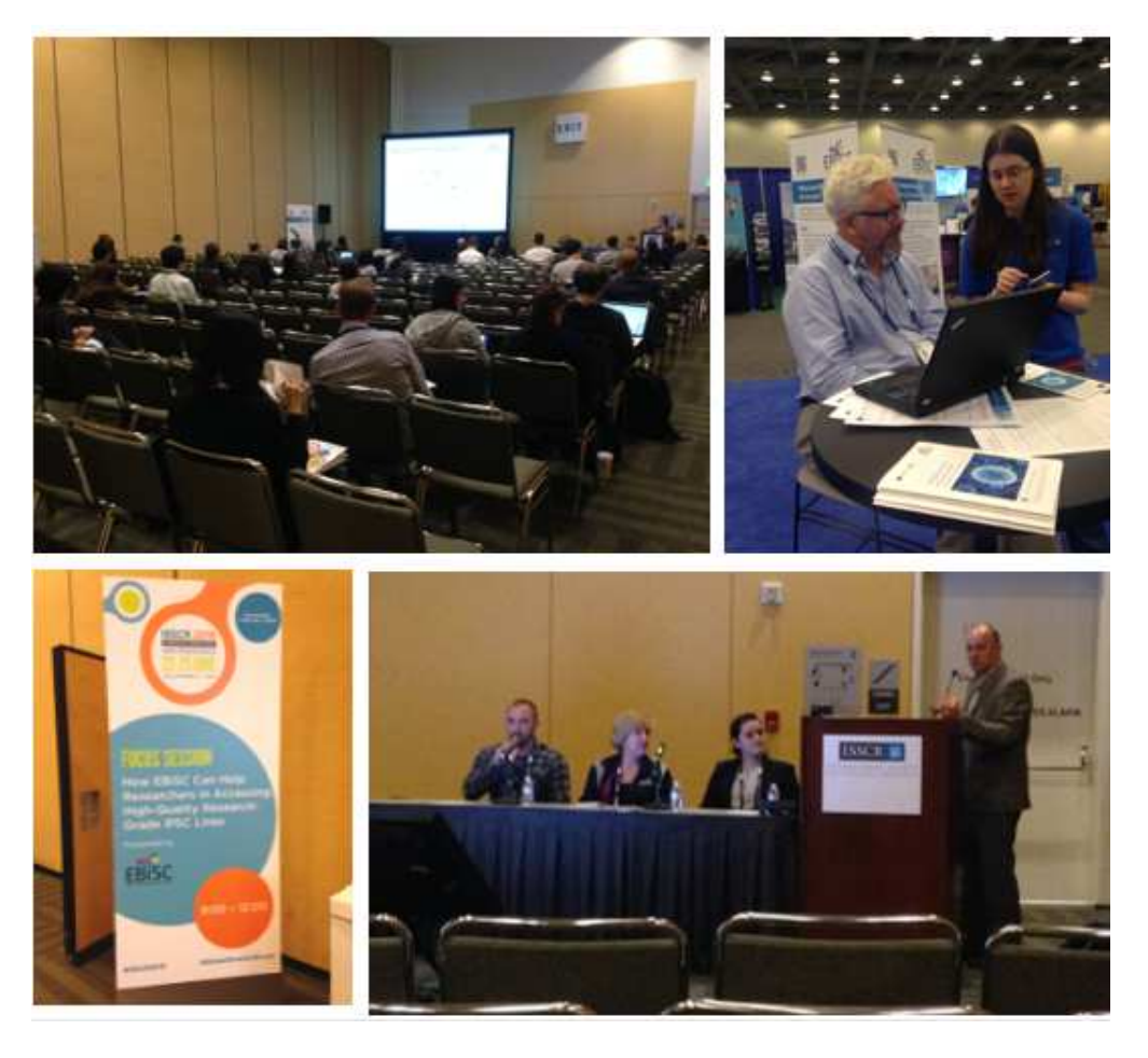
Figure 4: EBiSC participation in the ISSCR Annual Meeting 2016 in San Francisco / USA (22-25 June 2016)

The resource has also been promoted at relevant scientific conferences either as a dedicated EBiSC exhibit or as prominent part of the DH-CC offering and included in its marketing activities e.g. newsletters, brochures and digital marketing e.g. through Twitter and ResearchGate.